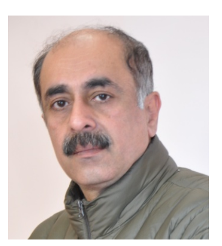
MBA in Strategy MA in International Relations