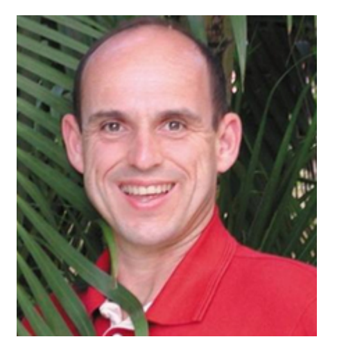
Nuclear Scientist. Founder and President of Environmentalists for Nuclear Energy – International, 1996