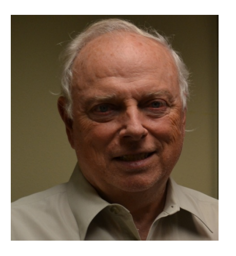
Civil Engineer President of EFN-USA President of Go Nuclear