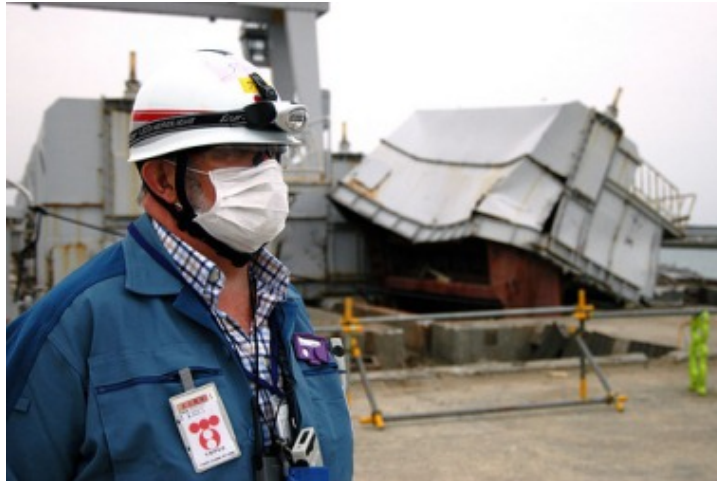
Mike Weightman surveys damage near the seawater intakes of the Fukushima Daiichi nuclear power plant during the IAEA tour

Cold shutdown a must for Fukushima return Billion-euro nuclear shutdown in Germany Chinese nuclear construction continues apace British, Finnish and German nuclear safety reports Prepare for a new nuclear industry Images show