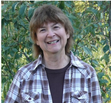
Karen Sackett Elementary & Environmental Education Montana